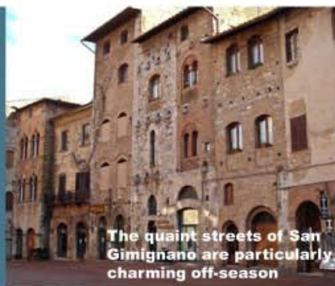
The quaint streets of San Gimignano are particularly charming off-season