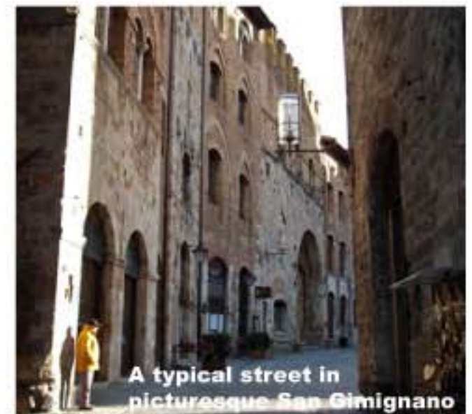
A typical street in picturesque San Gimignano

But out of season you can really get to its heart and see the other treasures that tourists don't usually get to see. There are free guided tours with art historians to places only open off season and other treats, such as tastings of local products, including the wonderful Vernaccia wines.