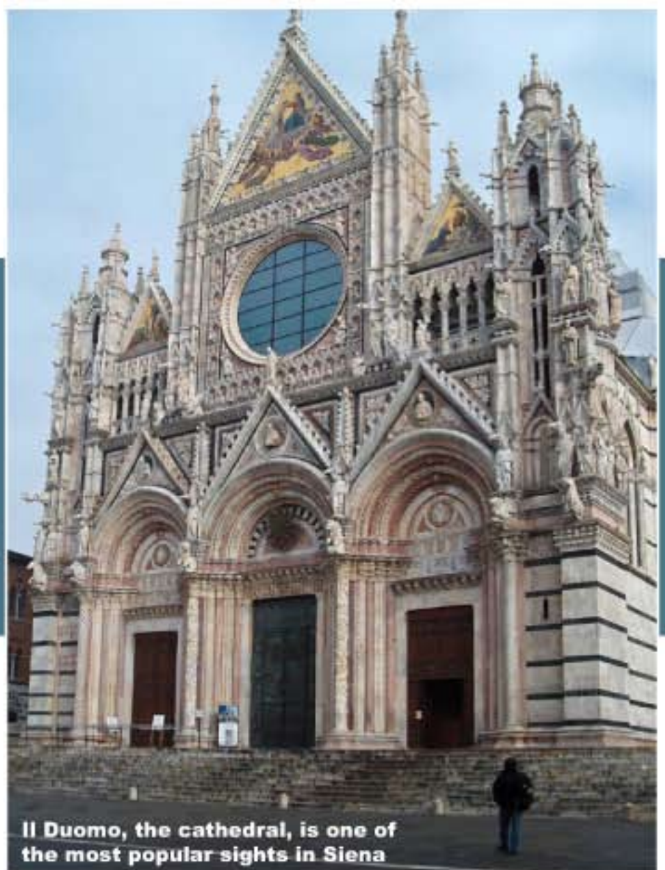
Il Duomo, the cathedral, is one of the most popular sights in Siena

I t's lunchtime in Siena and the Piazza del Campo – renowned the world over for packing in the people at its spectacular Palio – is almost deserted.