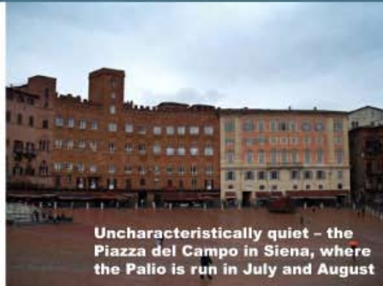
Uncharacteristically quiet – the Piazza del Campo in Siena, where the Palio is run in July and August

icons because their creators believed that going underground was going nearer to hell and that the icons would protect them.