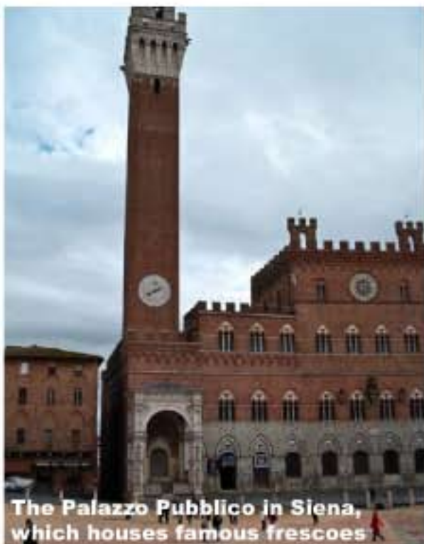
The Palazzo Pubblico in Siena, which houses famous frescoes

Which might come as a bit of a shock to anyone who has seen pictures of this beautiful medieval city – a UNESCO World Heritage Site no less – literally swarming with visitors.